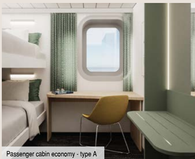
Passenger cabin economy - type A