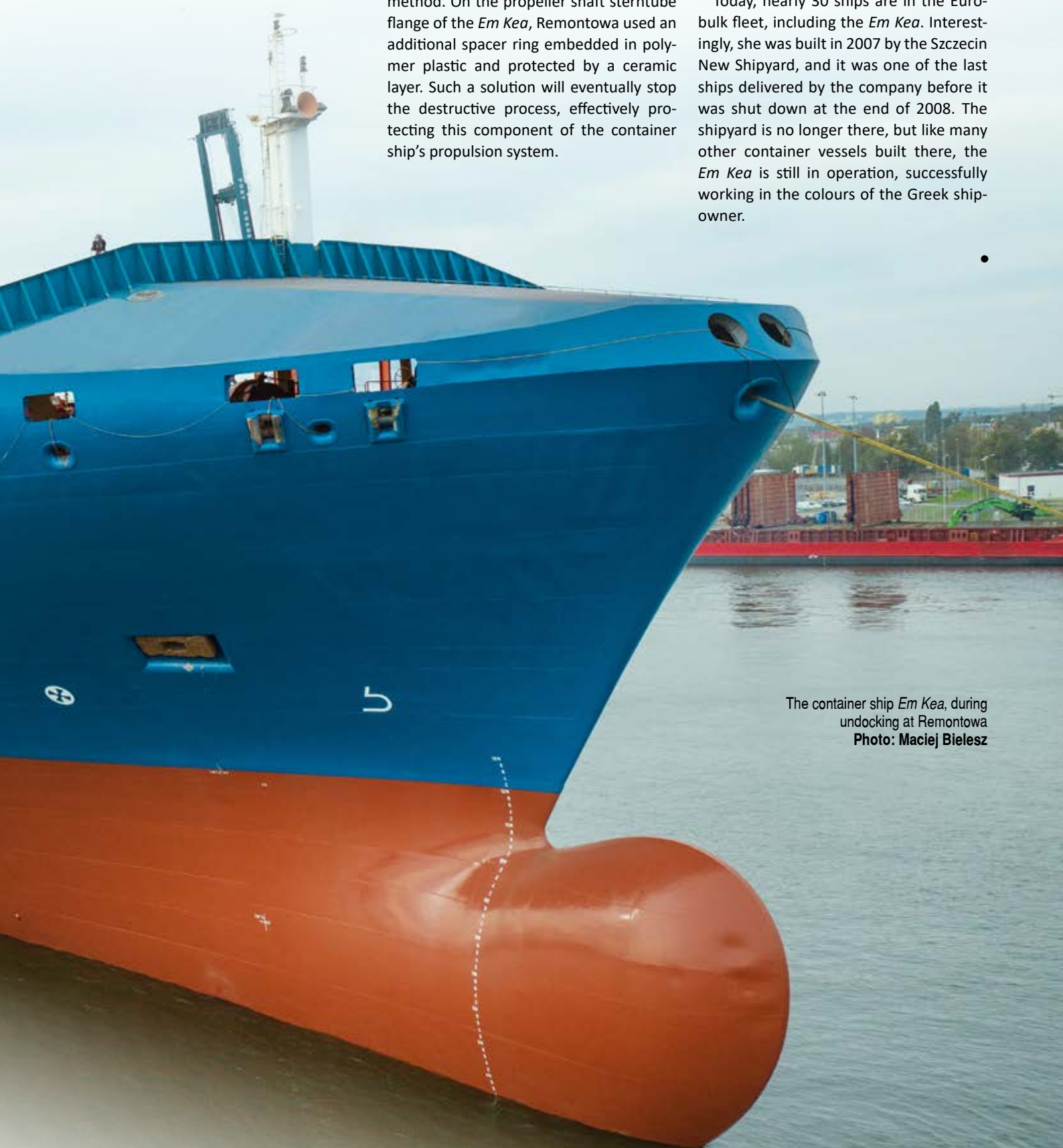
The container ship Em Kea , during undocking at Remontowa

Today, nearly 30 ships are in the Eurobulk fleet, including the Em Kea . Interestingly, she was built in 2007 by the Szczecin New Shipyard, and it was one of the last ships delivered by the company before it was shut down at the end of 2008. The shipyard is no longer there, but like many other container vessels built there, the Em Kea is still in operation, successfully working in the colours of the Greek ship-owner.