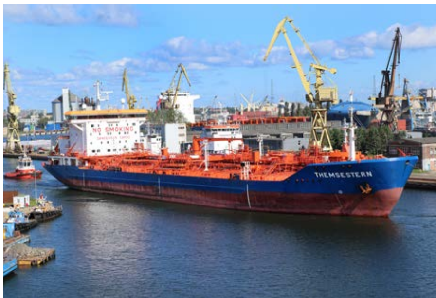
This year's overhaul of the chemical tanker Themsestern focused on a BWT system installation

In addition, we overhauled the box coolers, two shaft lines, and the propeller shaft seals. The scope of the maintenance and painting work included the full grit-blasting of the underwater part of the hull.