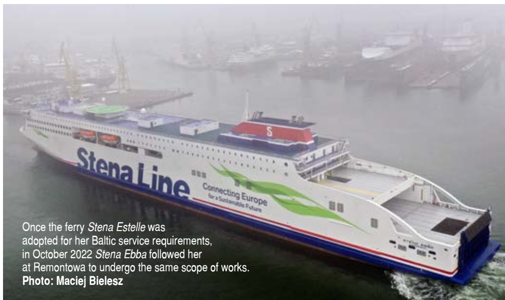
Once the ferry Stena Estelle was adopted for her Baltic service requirements, in October 2022 Stena Ebba followed her at Remontowa to undergo the same scope of works.

Stena Gothica was last overhauled here in 2020. This year's stay was primarily due to steel replacement in many places. We carried out the work in the stern frame area, following technological recommendations, in several stages. Our specialists took preliminary measurements on the shaft bearings and bearing gear while the ship was still afloat. Once the vessel was dry-docked, the measurements were repeated.