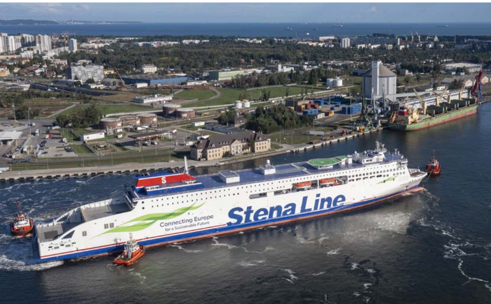
The Stena Estelle ferry - newly built in China while leaving Remontowa once she was adapted to the requirements of the Baltic service