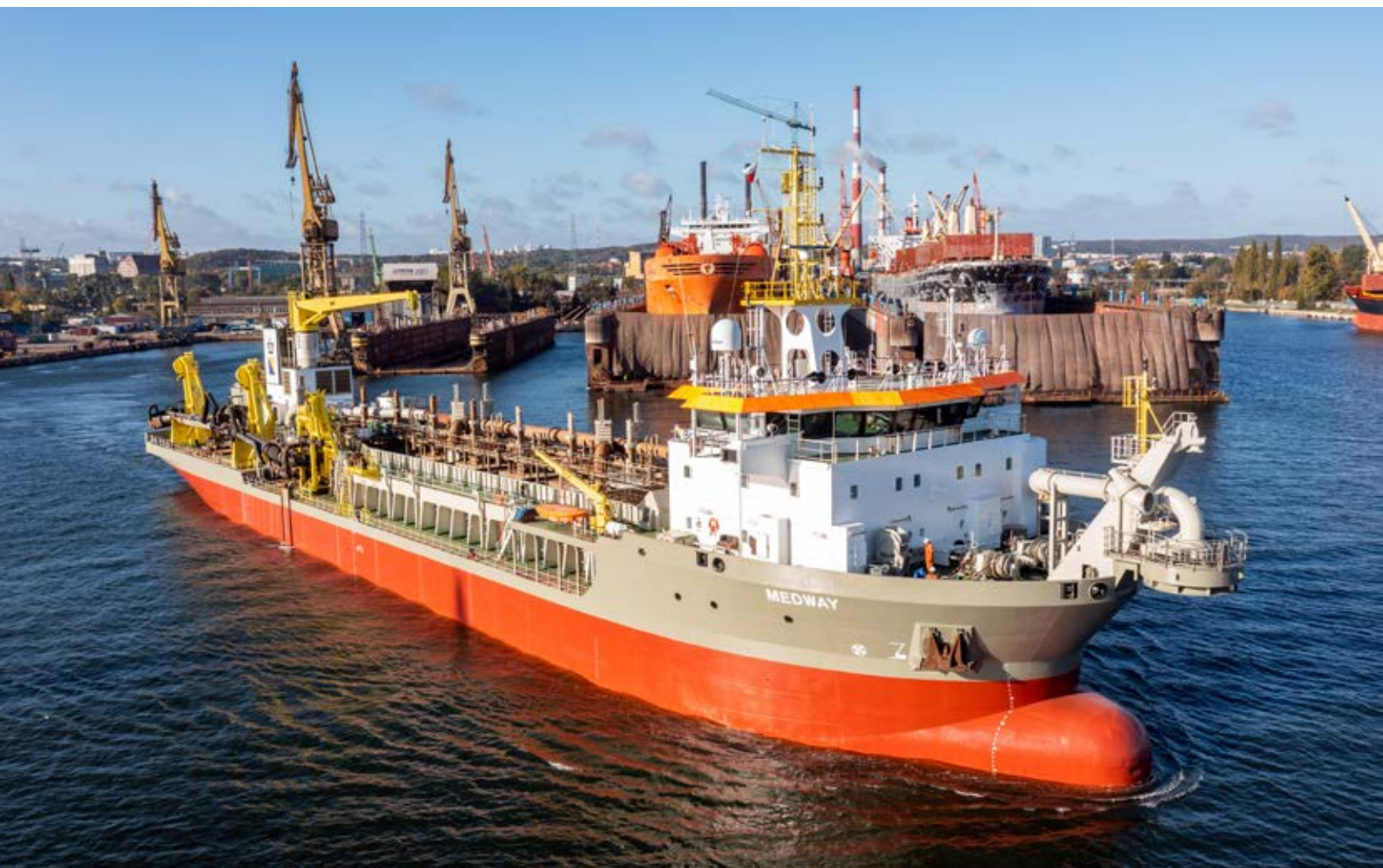
The refurbished TSHD Medway departs from Remontowa. Good luck, and see you again!