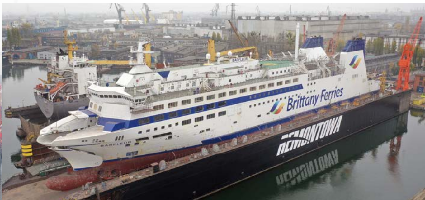
Barfleur lifted in the dock during intensive works

On the Barfleur ferry, an additional task was retrofitting her with a Ballast Water Treatment System, according to a design prepared by the Remontowa Marine Design & Consulting office of the Remontowa Holding group. At the Shipowner's request, we also installed a new IT system on this vessel.