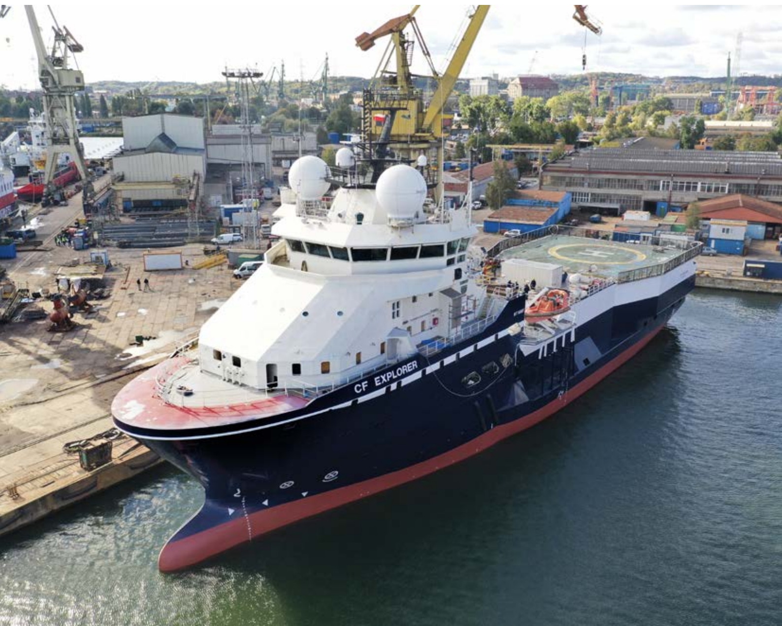
At Remontowa the vessel has got a new name CF Explorer and the blue livery of its current Owner

A research vessel that will become a Walk To Work ship