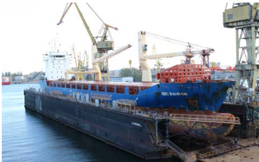
We retrofitted BBC Bahrain with Alfa Laval's BWT system

Driven by Shipowners' needs and certified by leading classification societies, Remontowa has also purchased specialised ballast water microbiological measurement tools. Now we can collect the ballast water samples and test the biological effectiveness of BWTS using the most modern methods very quickly, even within hours of sampling!