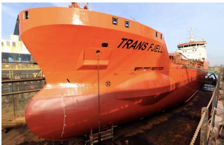
On Trans Fjell , our main task was to install a dual variant of Desmi's BWT system