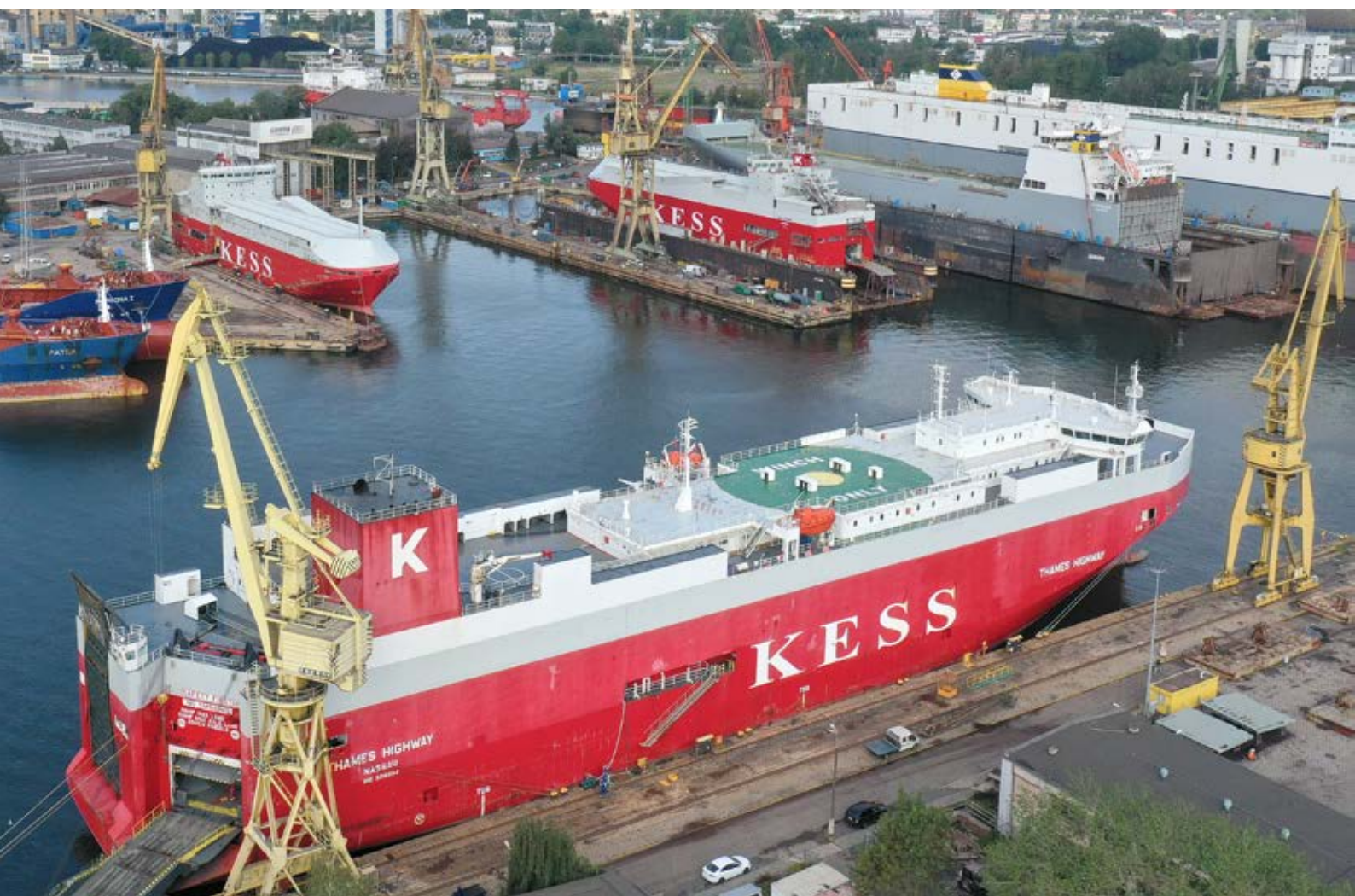
Thames Highway (in the foreground), Isar Highway and Ems Highway - seen at Remontowa in 2022