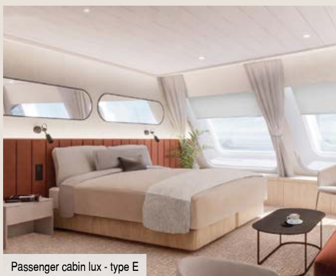
Passenger cabin lux - type E

A CNC plasma cutter has initiated the new Ro-Pax ferry building process at Remontowa