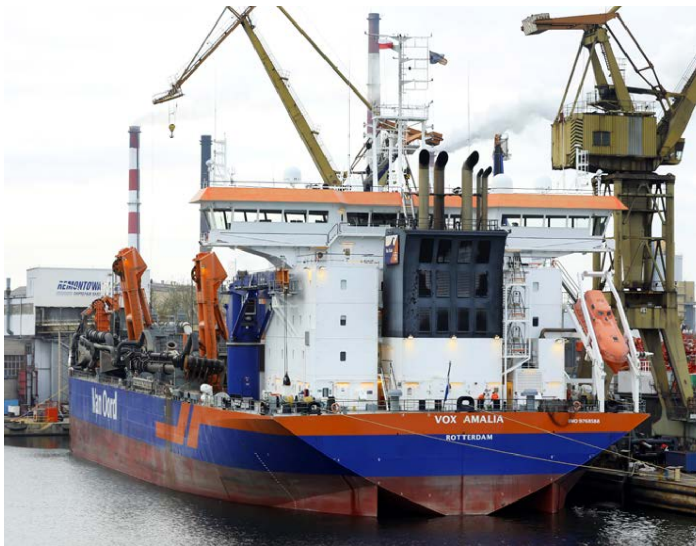
The dredger Vox Amalia – a frequent visitor to our shipyard