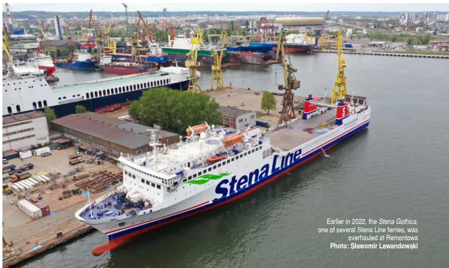
Earlier in 2022, the Stena Gothica , one of several Stena Line ferries, was overhauled at Remontowa

Other tasks included disassembly, inspection and reassembly of the machinery space ventilation fans and work on the boilers. The ferry Stena Gothica also underwent a major painting scope. We applied silicone paint on the hull, and the topside and funnels also received new coatings.