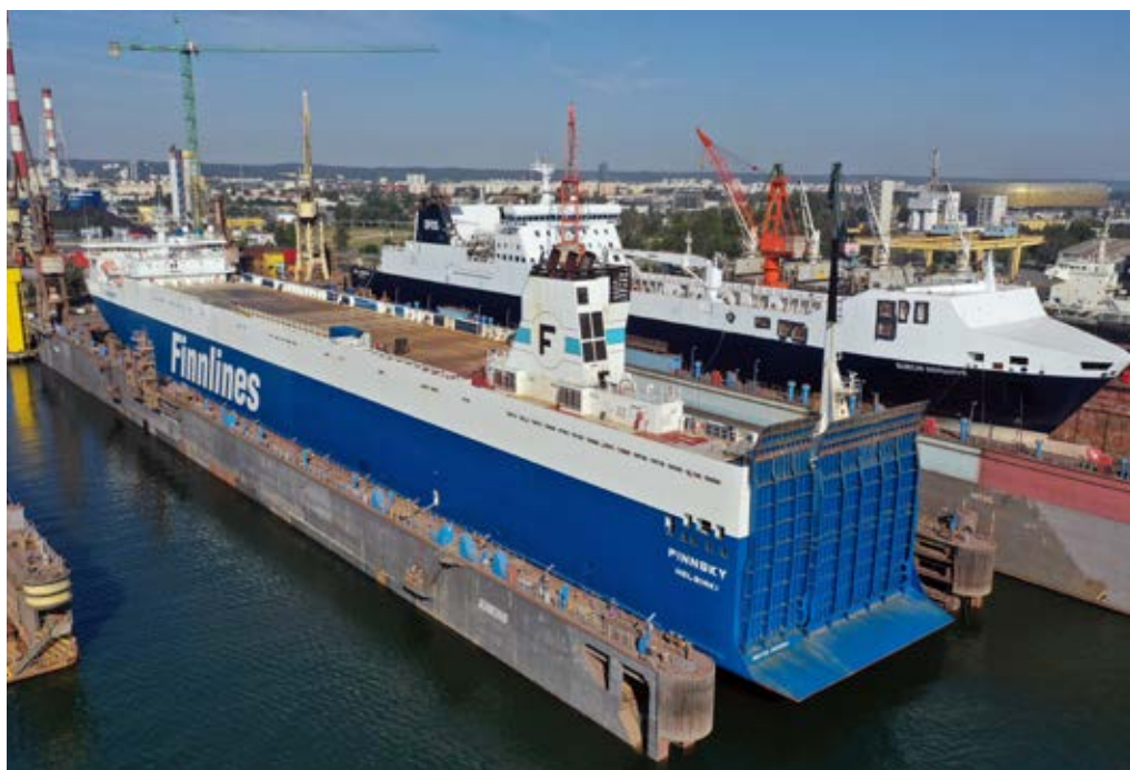
The Finnsky , one of several Finnlines Ro-Ro ships serviced in 2022 at Remontowa

The Shipowner additionally ordered the reinforcement of a sterntube sealing and