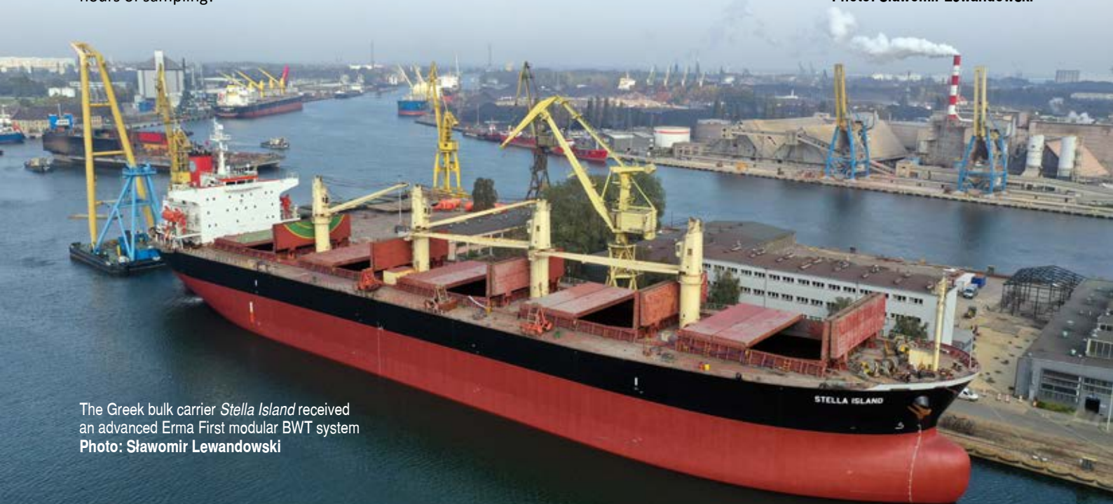
The Greek bulk carrier Stella Island received an advanced Erma First modular BWT system