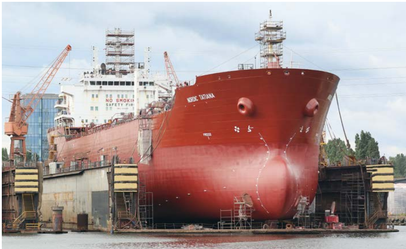
On Nordic Tatiana , we installed the BWT system supplied by Techcross

We also performed tank maintenance using the Ultra High-Pressure Washing method instead of traditional grit-blasting, which allowed us to carry out several other works in the area in parallel. Three mooring winches and a Becker rudder blade also required repairs.